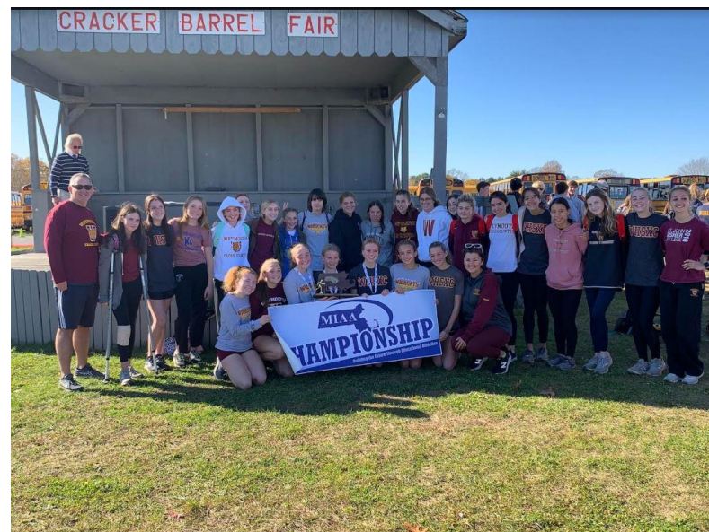
Girls Cross Country Wins 2021 State 1a Championship