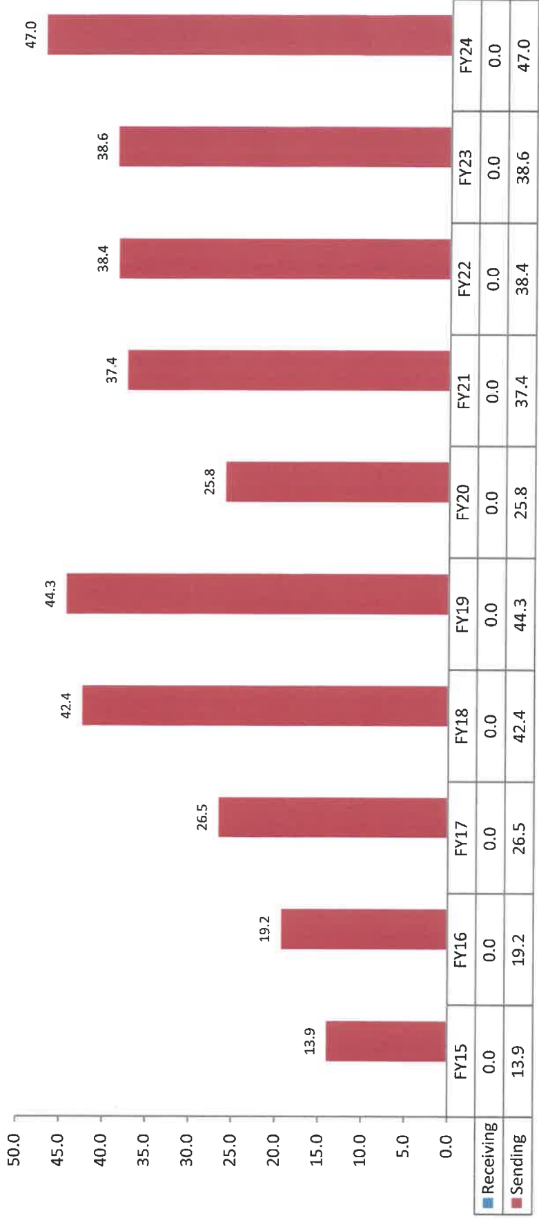
Weymouth school choice enrollment trends