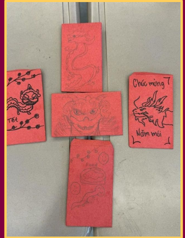
Lunar New Year Envelopes (Lì Xì)