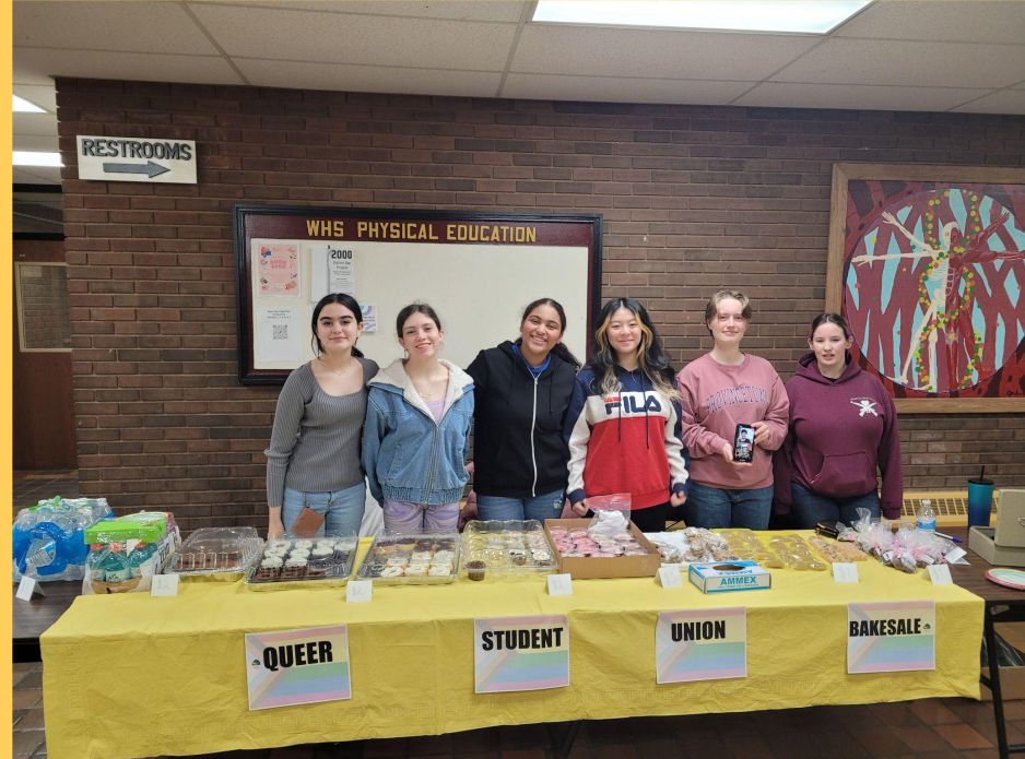
QSU bakesale at the girl's basketball game!